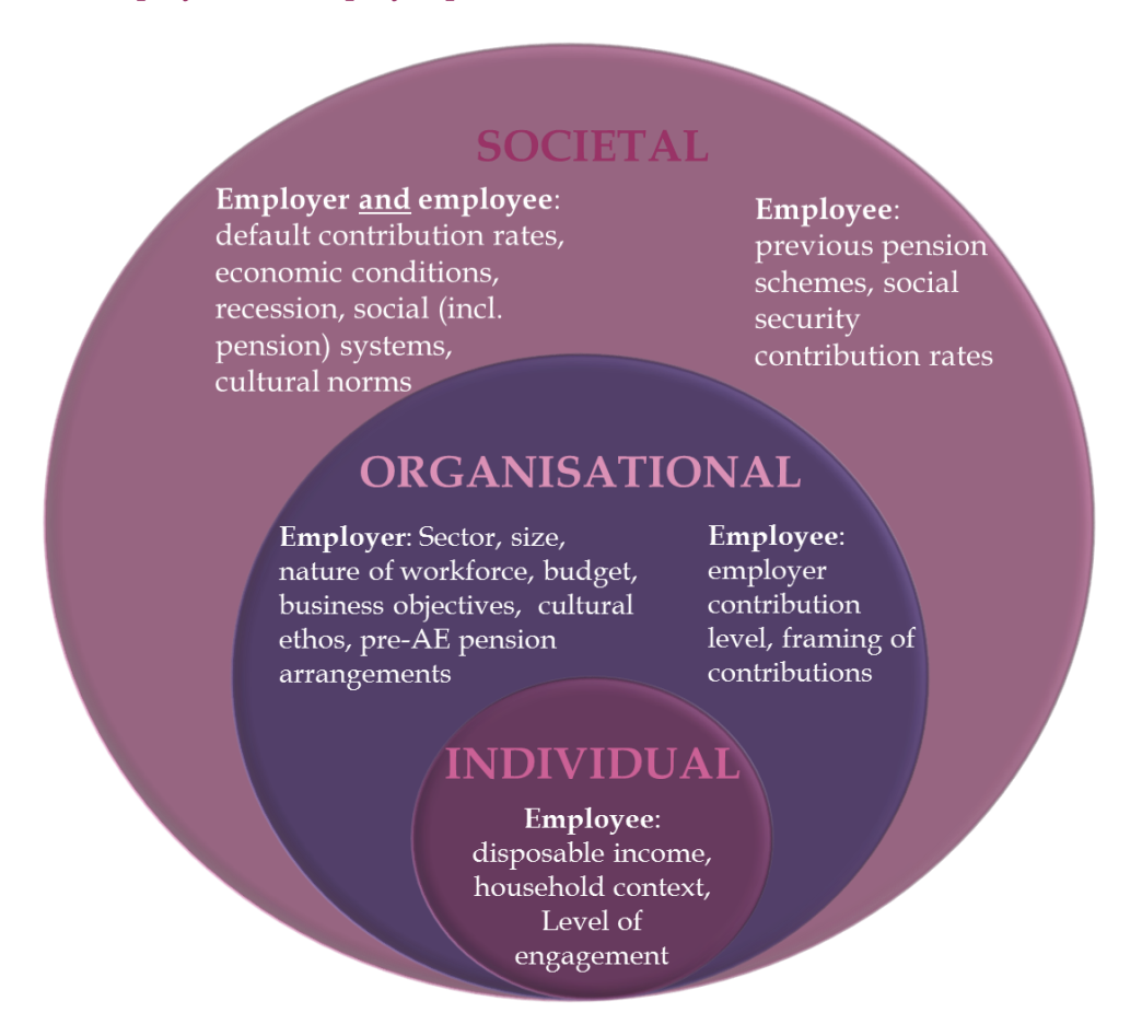
Figure 1: Employee and employer pension contributions – the three levels

There are also factors within the individual level. These factors relate to personal income and financial situations as well as family and household circumstances. These can be addressed through various behavioural techniques.