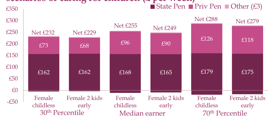
Chart 4: weekly post retirement income for woman earning at the 30th percentile, median, and 70th percentile levels under various scenarios of caring for children (£ per week)

The analysis in this note as- tributions and investment period sumes that State Pension is paid will lead to an increase in the pen-