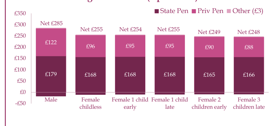
Chart 3: weekly post retirement income for median earning man and women under various scenarios of caring for children (£ per week)

who have more children. This is female earnings, because the Motherhood Penalty earning at the 70th percentile. increases quite sharply from 2% for a mother who has one child to Lower paid women receive a 12% for a mother with two chil- higher proportion of their post